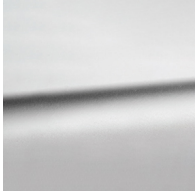
Stainless Steel Inox - SST

Digital: Not all screens are calibrated the same, and therefore, colors will appear differently between screens. Physical: When texture is involved, there will be variations in color, character and tone within a product series and between product families.